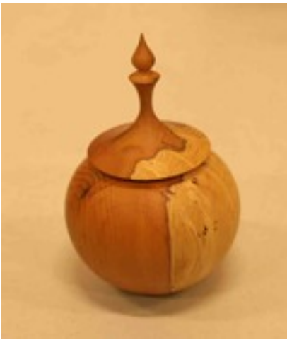
The Yew lidded box