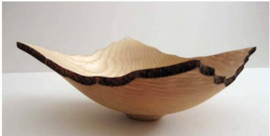
The Square edged bowl form with shaped edge