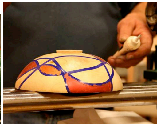
Using Banding to make segments