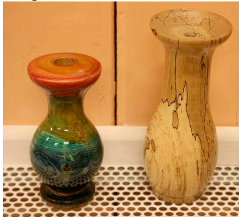
Coloured and sanded work