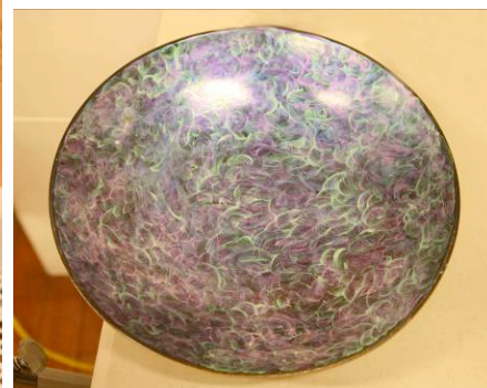
JoSonja coloured finish