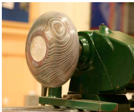
Limed waxing on Ash wood